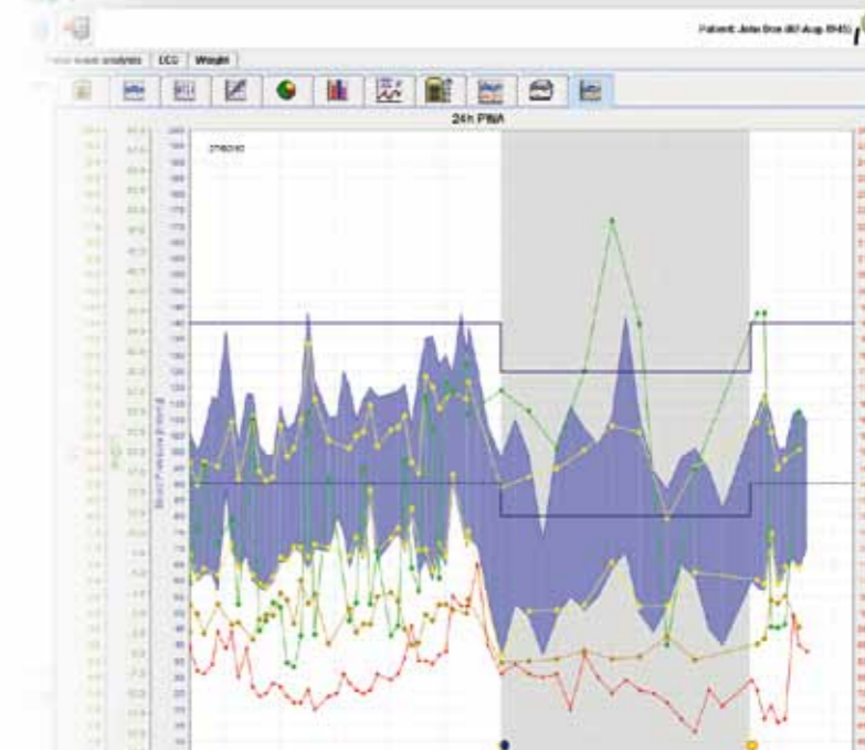
24h PWA profile