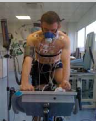
Assessment of performance limiting factors