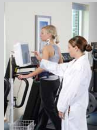
Routine hemodynamic evaluations