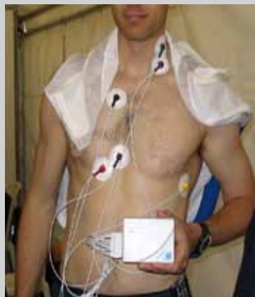
Paris Marathon field experiments