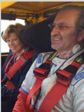
Rally race field experiments

Works with PhysioFlow® PF107 MS Windows-based software for display, data analysis, and storage